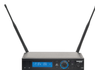
SW40-RH SINGLE CHANNEL RECEIVER